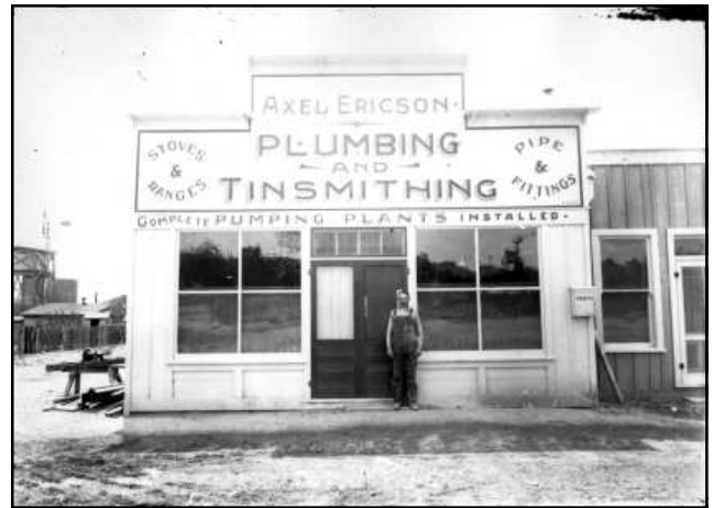
Photo # 1679 Axel Ericson pictured in front of his metals and plumbing shop on Beale Street, Kingman about 1920.