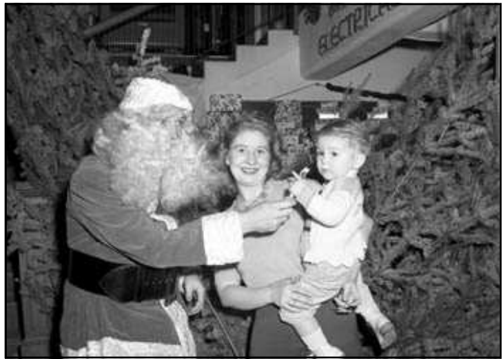
Santa at Central Commercial in 1950