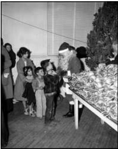
Santa At the Elks 468 in 1946