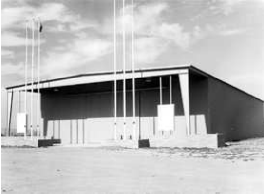
Fair building, May 18 1961