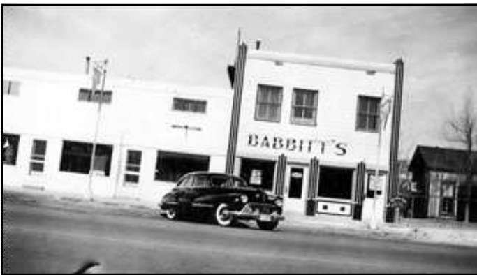
Photo #13881.... The temporary Babbitt Brothers store on Beale Street between Third and Fourth. This building is now occupied by a printing business.