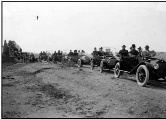
EMF's (Every Morning Fix-em's) Built by Studebaker

Twelve were brought in by rail and sold by Myrt Wagner and Bill Tarr around 1910, M L Dimmick driving first car. Location is cattle loading chute at Berry, Cars had to be pushed up the chute - could not make grade.