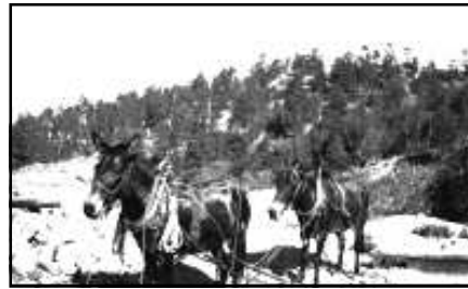
Mules at mining

They taught their pointers that when the time came, the horse that was on the outside was ready and the inside horse pulled over and when the teamster called the name of the outside horse, that horse jumped the chain which stood up maybe two or two and a half feet off the ground and was taut. He jumped the chain and crowded his mate against the bank just as tightly as possible and the wheelers also, in order to be sure the wagon didn't sheer off, though the leaders might be out of sight. I never saw a one of those horses trip and fall, and I never saw one that was not ready the instant his master called his name. He would just speak the name and the right horse would jump at the right time. I tell you those old teamsters in the mountains really had what it takes."