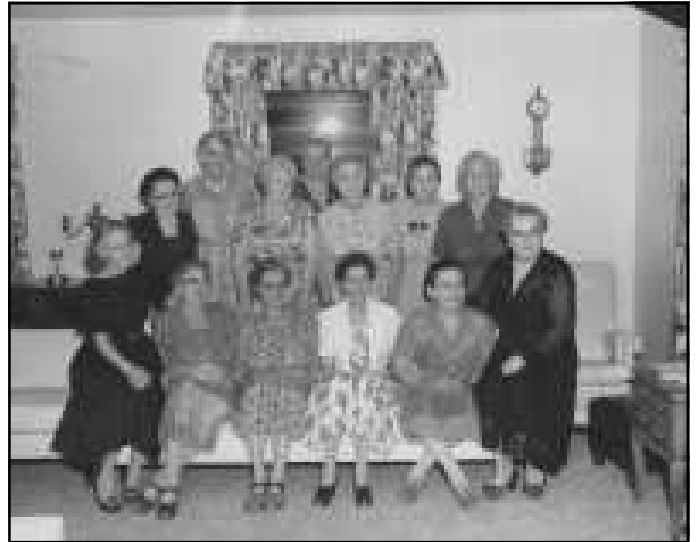
Photo #3637, Original members of the Daughters of Mohave County Pioneers