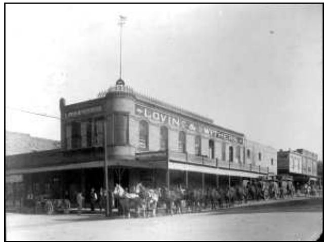
Lovin and Withers Building