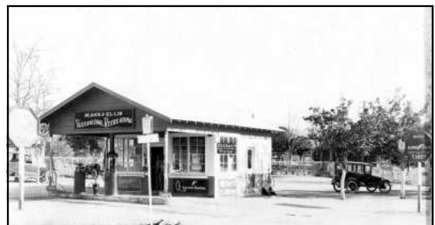
First service station in Kingman. Located on South Front Street (Topeka) in Kingman.