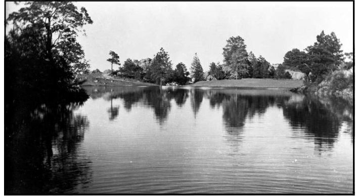
Pic. # 5631

Mohave County will honor its pioneer residents at a big barbeque and community celebration here Saturday night. A crowd in excess of 1000 is expected to be on hand Saturday night at the St. Mary's school playground to enjoy a beer barbeque and an evenings entertainment. The event will be staged by the Daughters of Mohave County Pioneers as a benefit for the establishment of a county pioneers historical museum. A building will be built by the Chamber of Commerce to home the museum.