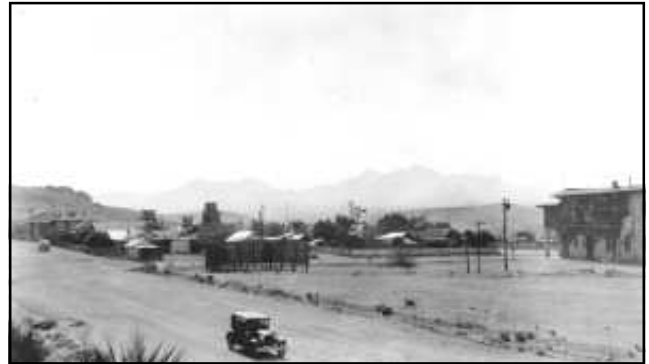
Looking Southeast from Spring & 2nd Streets Kingman in Mid 1930's. Note car. Vacant lot where St. Mary's school now is playground. Sign board where Sanderson's Apts. Later were built and then demolished. All residences removed from city complex. Water tanks and towers reflecting Kingman personal domestic water supply by pumping from their own wells before Kingman Water Co. Service.