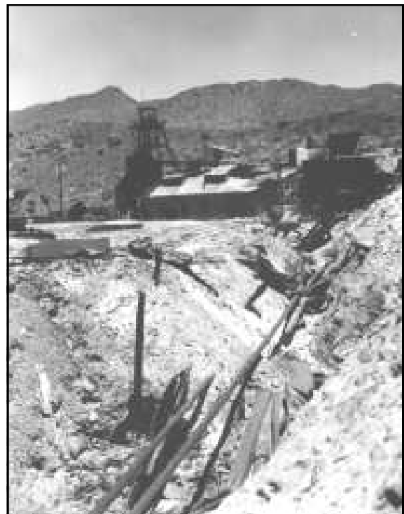
Tennessee Mine - Chloride, Arizona