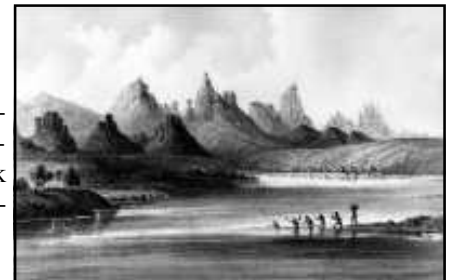
Photo #692, The Needles, etching of Colorado River with rock formations in background.