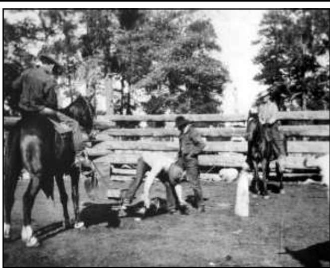
Branding of Cattle