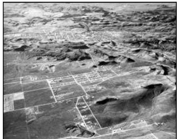
Aerial View of Kingman, 1960