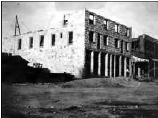
Mulligan-Thompson building under construction (1909), later known as Brunswick Hotel Kingman's first 3 story building. Note Beale Hotel on right with one story building between. Front Street (Andy Devine)

The Happy Hour Theater is putting in new chairs and soon the old benches will be removed. They are also putting in new scenery and fixing up the Stage. Mr. Carpenter has spent a good deal of money in getting things in good shape and now has a first class place and deserves the patronage of the people.