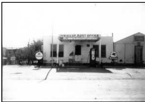
The Wickieup General Store and Post Office ca. 1950's Photo#: 14933

Kingman's first school house was built around 1886 on about the same location as the current "Little Red School House" on the southwest corner of Beale and 4 th Street in downtown Kingman. The first building was a wooden frame structure as opposed to the later school house which is the current brick building. The Kingman Municipal Court system currently occupies the former house of learning.