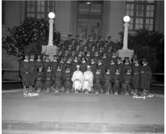
Kingman High School Class of 1960