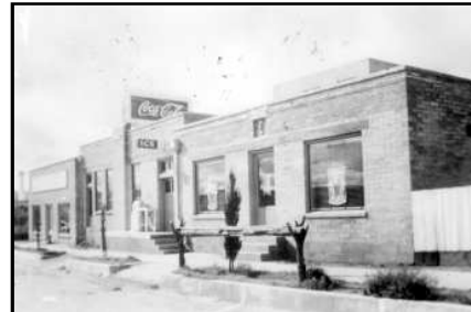
View of Lovin Ice House and Coca-Cola plant, a brick building. Between 3rd and 4th St.

The Mulligan-Thompson Hotel is to open its dining room tomorrow evening. The hotel has been named the Brunswick. The furnishing of the place are far ahead of anything in Kingman and are along the old Mission style.