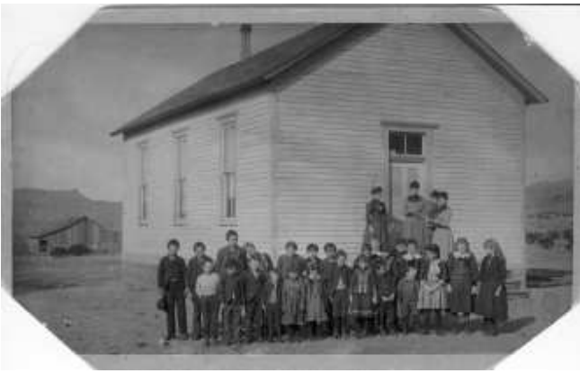
Kingman's first schoolhouse ca. 1886: Photo# 10014